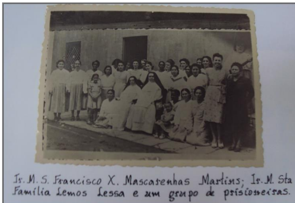
Figure 4 - Group of Prisoners with Founding Sisters