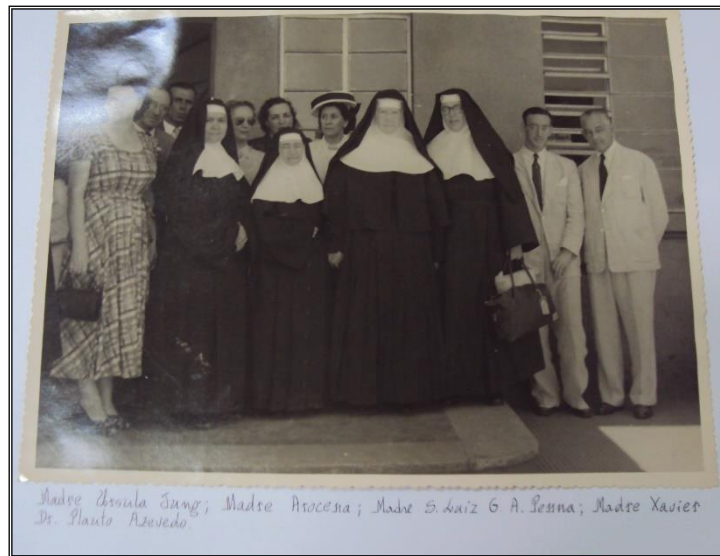
Figure 2 - First Regular Visit (1937)