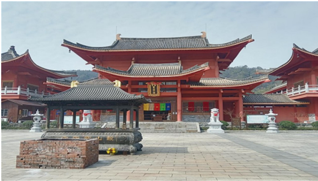
Figure 2. Banoing Temple

greatness but also serve as a witness to the historical and cultural interactions that have built Shanxi. They emphasize the region's importance as a hub of artistic innovation and cultural interaction, drawing inspiration from adjacent regions and the Silk Road trading route. The murals attest to the diverse nature of cultural legacy, which includes religious, social, and artistic aspects (Velychko & Li, 2022). Figure 2 shows the Baoning Temple.