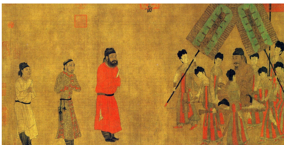
Figure 3. Tang Dynasty Mural

The historical background of the Baoning Temple in Shanxi, China, is critical for understanding its cultural value and the evolution of its aesthetic and religious features. The Baoning Temple dates back to the Tang Dynasty (Figure 3), when China experienced considerable cultural blossoming (Fan, Wang, & Xiao, 2021). The structure was initially constructed in the early eighth century of the Common Era with the support of Emperor Dezong. In this era, Buddhism garnered widespread acceptance, leading to the construction of numerous temples throughout the nation. The Baoning Temple functioned as a hub for Buddhist praxis and exerted a noteworthy influence in disseminating the doctrines of Buddhism across the region (C. Liu et al., 2020).