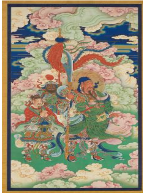
Figure 5. Qing Dynasty Mural

The importance of the Baoning Temple in Chinese Buddhism was maintained during the Qing Dynasty as shown in Figure 5. Despite obstacles such as wars and societal changes, the temple survived and maintained its holy significance. However, due to natural calamities and deteriorating infrastructure, the temple experienced additional modifications and reconstructions over this time period. These initiatives attempted to preserve the temple's cultural history and secure its survival for future generations (Mele, Filieri, & De Carlo, 2023).