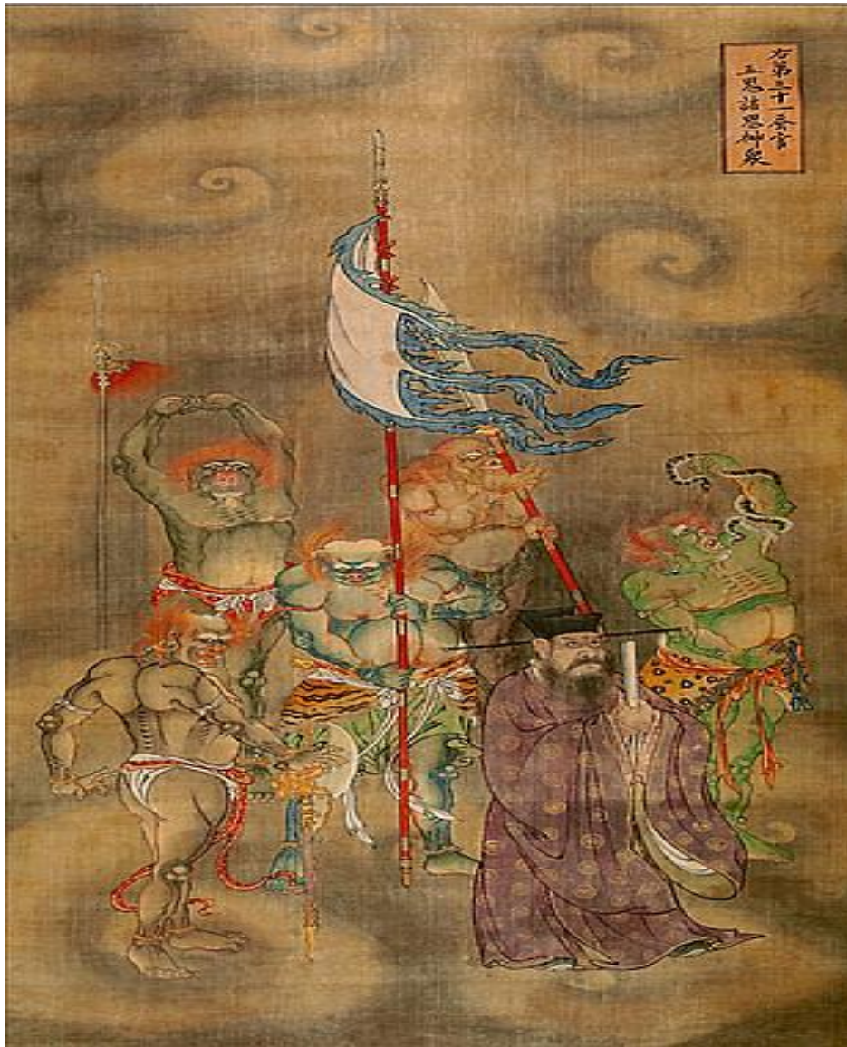
Figure 1. Murals in Banoing Temple

The murals found in Baoning Temple located in Shanxi, China, are of great cultural significance due to their ability to offer insight into the region's extensive artistic and historical legacy. The murals, which have an ancient origin, provide significant knowledge regarding the religious, social, and artistic customs of the corresponding period (Jingwen Qiu, Zhijie Zhang, & Tiewa Cao, 2019). The investigation of the cultural importance of artworks through the lenses of artists and art historians who are influenced by cultural heritage provides a distinct and all-encompassing comprehension of their artistic merit, historical milieu, and symbolic depictions (Mah et al., 2019). The Baoning Temple, situated in the Shanxi province, has been historically esteemed as a significant location of cultural and spiritual significance. The murals that embellish the walls of the temple serve as evidence of the skill and artistic ingenuity possessed by their makers. The murals not only provide a visually stimulating experience but also encapsulate the cultural and historical narratives of previous eras (Bukhori, Hidayanti, & Situmorang, 2022). Figure 1 shows the sample of mural in Baoning Temple.