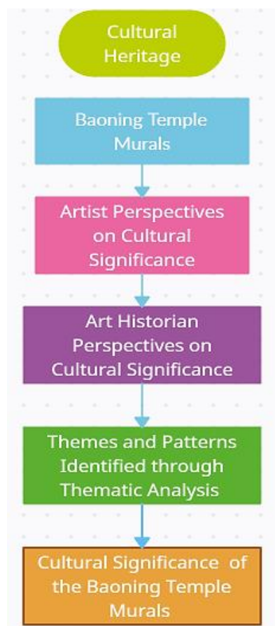
Figure 6. Layout of Literature and Findings