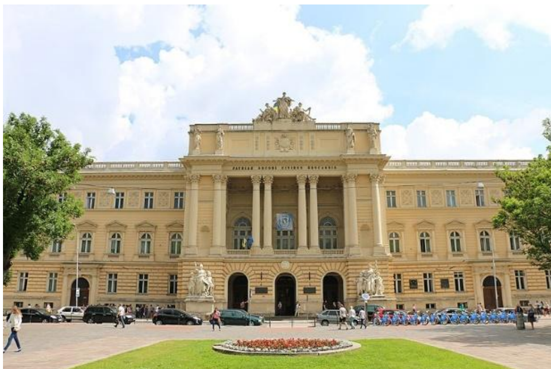
Figure 4. Ivan Franko National University of Lviv

In the example of Ukraine as one of the post-Soviet states, the problem of university theatre studies is particularly pronounced. The Soviet legacy in the form of theatre studies as applied art education and science, integrated only in art universities, began to change and gain the features of Western European models. The first (and the only) example of the integration of theatre studies into the structure of the classical university was the experience of the Ivan Franko National University of Lviv (Figure 4). In 1999, the Department of Theatre Studies and Acting appeared at the Faculty of Philology under the leadership of the head, Prof. B. Kozak. This was preceded by long training at the initiative and assistance of the Rector of the University Prof. I. Vakarchuk, for whom the emergence of theatrical science in the university space was completely grounded and natural. In his reflections on this issue, Rector I. Vakarchuk invariably referred to the practice of European universities and emphasised the importance of university space for theatre studies and the importance of theatre studies, acting education, and other art areas for classical universities. In 2004, when creating a separate faculty of culture and arts, Rector I. Vakarchuk emphasised the importance of combining the natural sciences with the humanities, concisely with art history (Harbuziuk, 2004).