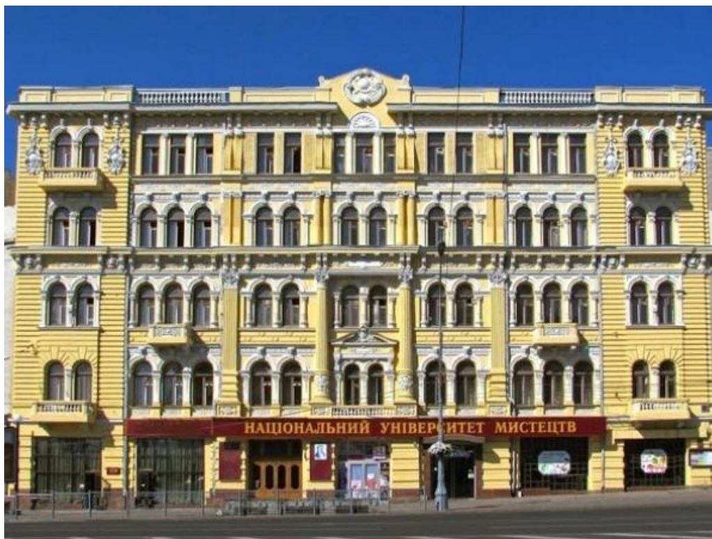
Figure 3. Kharkiv I. Kotlyarevsky National University of Arts Nowadays

The unequivocal advantage of this method of pedagogy persists in its provision of maximal proximity between students and their counterparts from diverse theatrical domains, including directors, actors, and managers. This environment fosters the cultivation of a theatre critic well-versed in the intricacies of theatre production, as well as specialists primed for direct engagement within theatrical enterprises. Notably, the distinctive characteristic of this pedagogical approach lies in its heightened emphasis on immediate engagement with ongoing artistic processes. However, this emphasis also results in a divergence from conventional academic pursuits, consequently impeding the evolution of scholarly discourse and the nurturing of theatre theorists within academic scholarship. It was Professor Klekovkin (2013) who initially brought attention to the matter of theatre studies within the university context in Ukraine through his published works. His book, "Theatre at the Table. Methodology of Theatre Studies. Travel Diary," notably featured a section titled "University Introductions to Theatre Studies: Christopher Balme and Robert Leach."