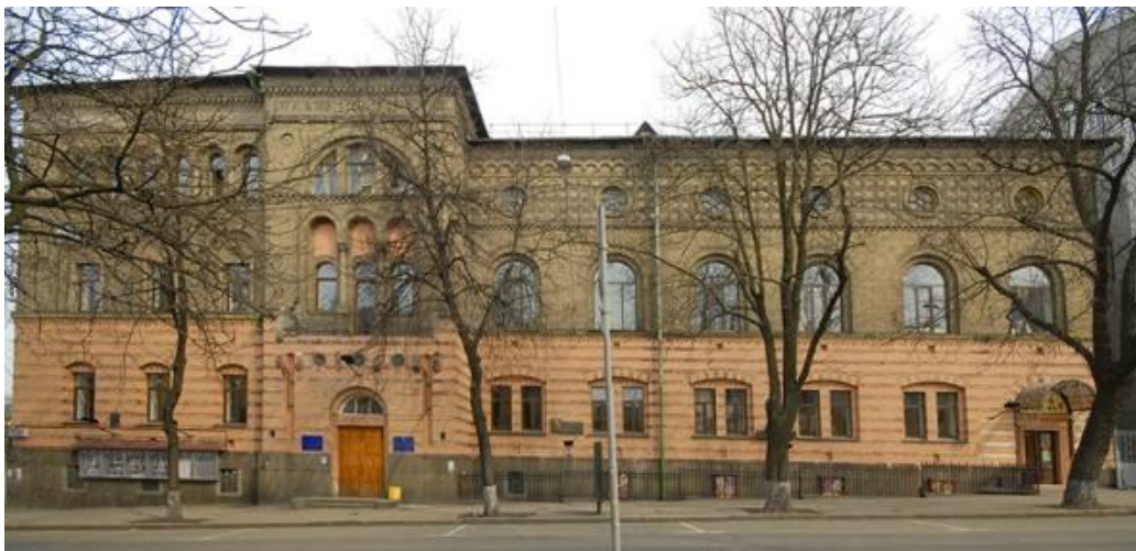
Figure 2. Kyiv National I. K. Karpenko-Kary Theatre, Cinema, and Television University Nowadays